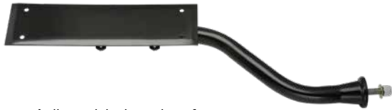
Adjustable bracket for easy installation